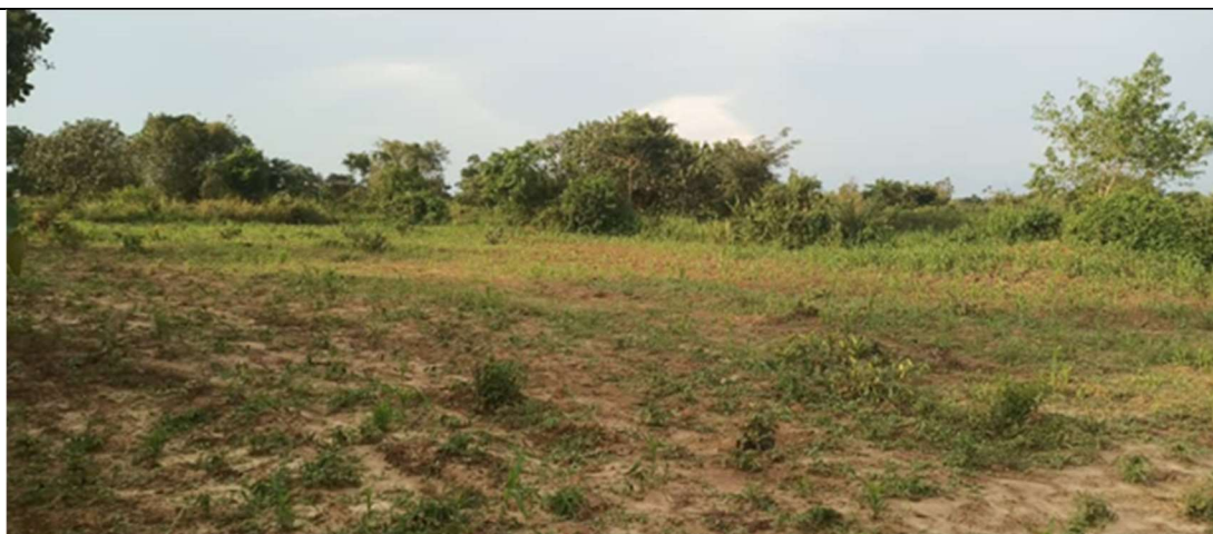
One view of the large plot of land purchased for Serere Lutheran Church