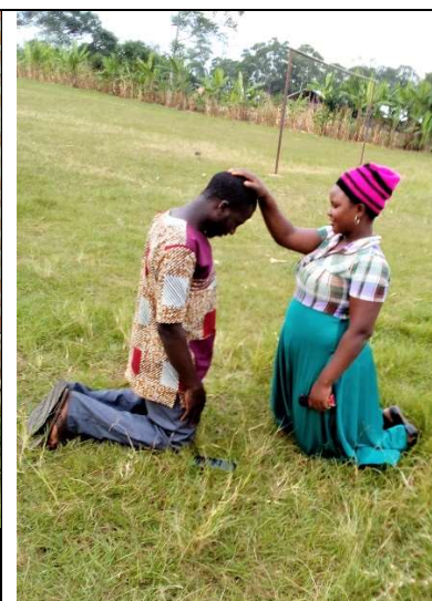
Photos from the Renewal Weekend at Mbulamuti Lutheran Church