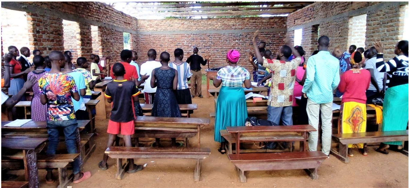
Renewal Weekend at Mbulamuti Lutheran Church

Lutheran Lay Renewal of America 209 Thornwood Drive Butler, PA 16001 724-287-5151 LLRAJ316@gmail.com www.lutheranrenewal.com