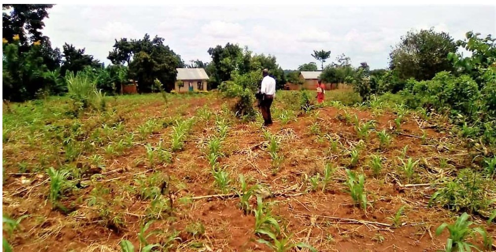
Parcel of land being purchased for the new Nakavuma congregation